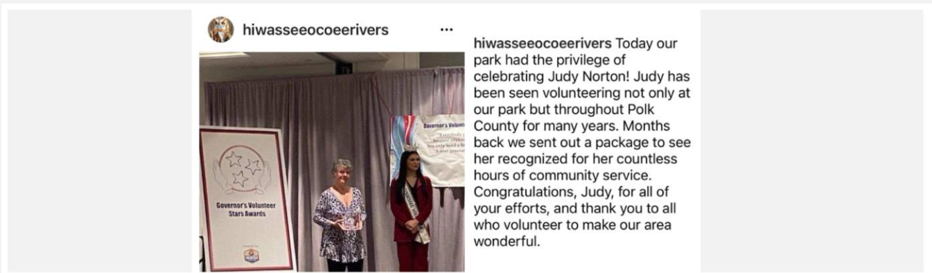
Hiwassee/Ocoee Rivers State Park Instagram